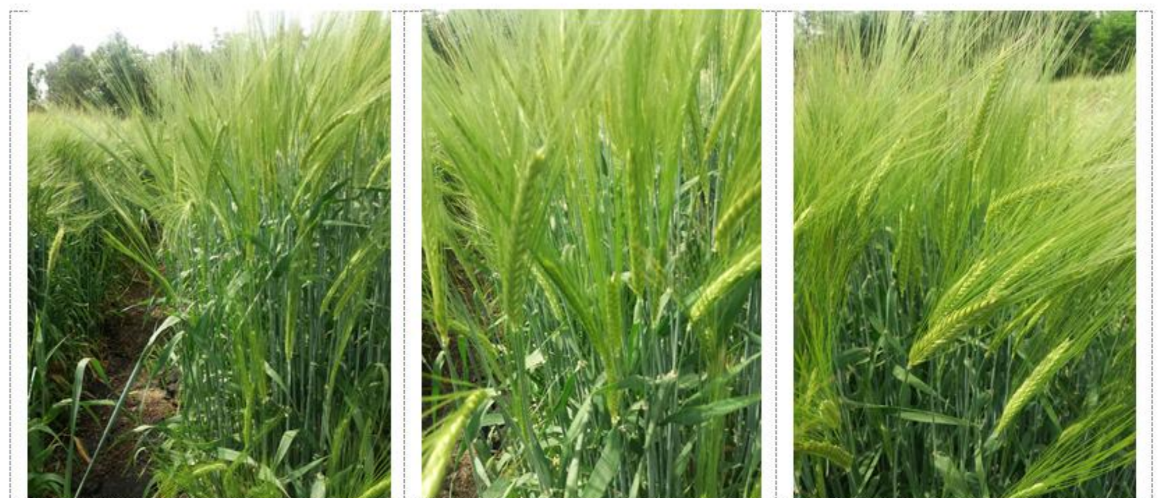
Figure 2. Gorast

/Winter two-rowed, Hordeum vulgare L. sensu lato. Subs.